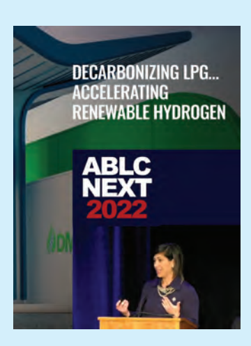
Keynote reveals plans for >200 million gallons per year (12 minutes)