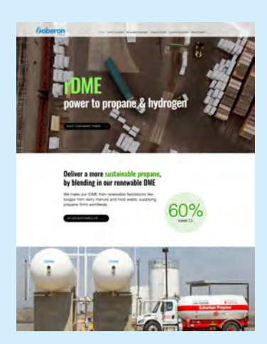
Visit Oberon's website

Oberon's rDME is a here-now, practical way to decarbonize LPG and provide a new way to deliver renewable hydrogen for transportation, industry and heating. With the world's first commercial-scale plant and a pipeline of projects for hundreds of millions of gallons per year, Oberon aims to deliver major environmental benefits while energizing local communities with new plants and jobs, turning waste into value.