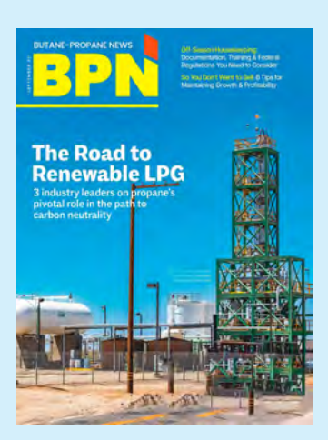
Read cover story by Oberon new business options for LPG companies